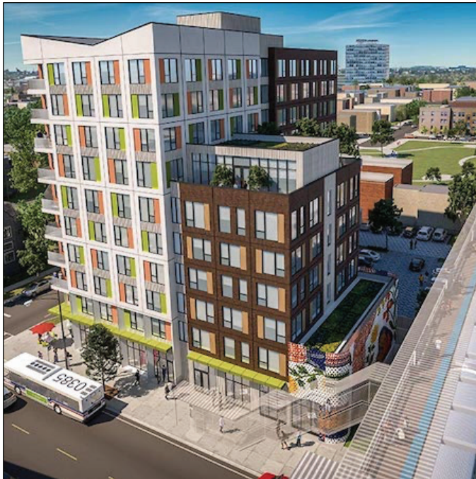
Landon Bone Baker Architects and Moody Nolan

Transit Oriented Developments. The style of urban design known as Transit Oriented Developments, or TODs, builds an entire neighborhood around proximity to a new or existing mass transit stop or station. Residential, service, commercial, and transit features are combined, at a