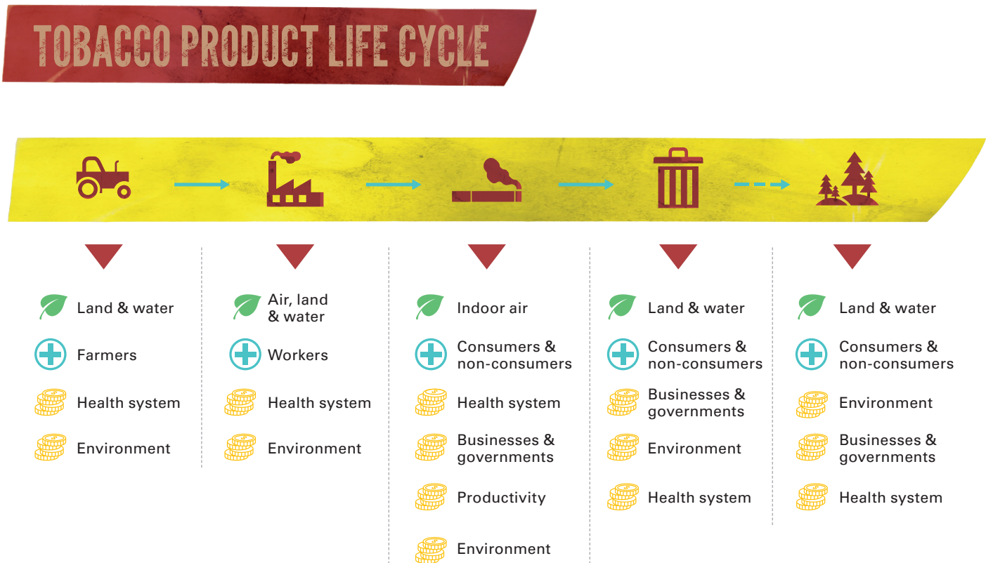
FIG 1. IMPACT OF TOBACCO LIFE CYCLE ON HEALTH, ENVIRONMENT AND ECONOMICS

Fig. 1 summarizes the impact of each of the five stages of the tobacco production and consumption life cycle (farming/cultivation, production, consumption, disposal and “residual” tobacco waste that remains in the environment) on our health, environments and economies. The figure illustrates how every stage of the tobacco life cycle impacts several different factors, contributing to long-lasting and persistent adverse effects (1–4).